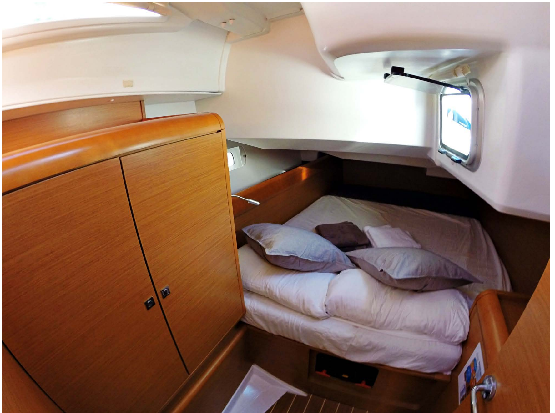
Aft cabin – Starboard