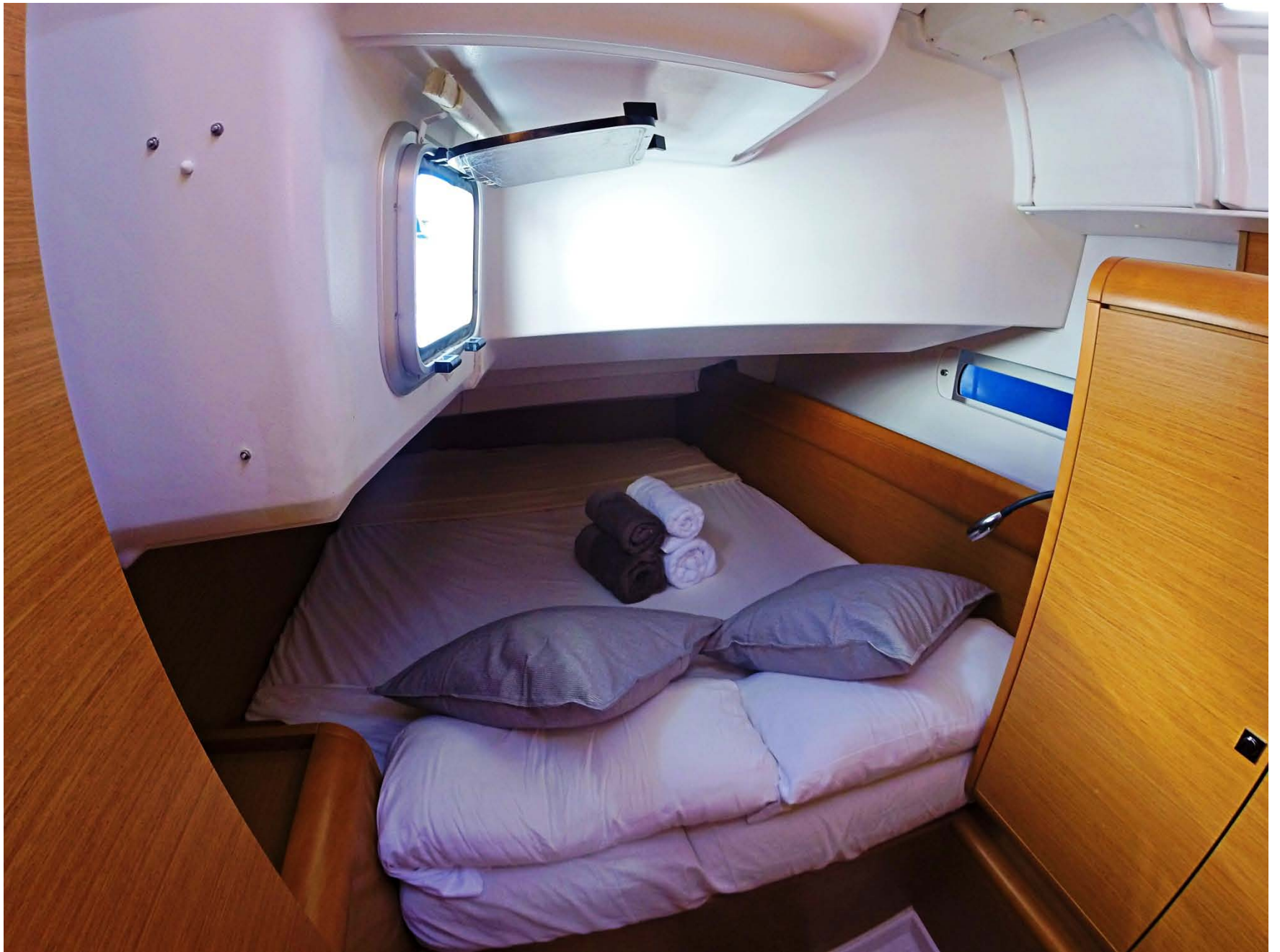
Aft cabin – Port