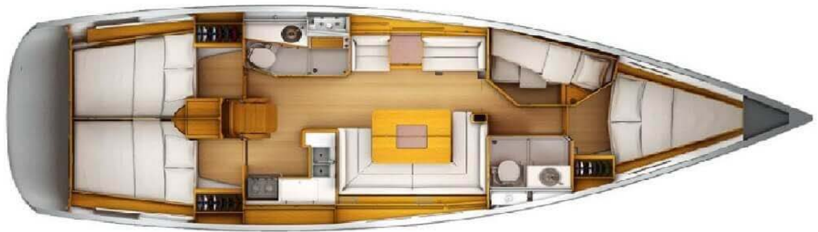
Esquitx – Jeanneau Sun Odyssey 439