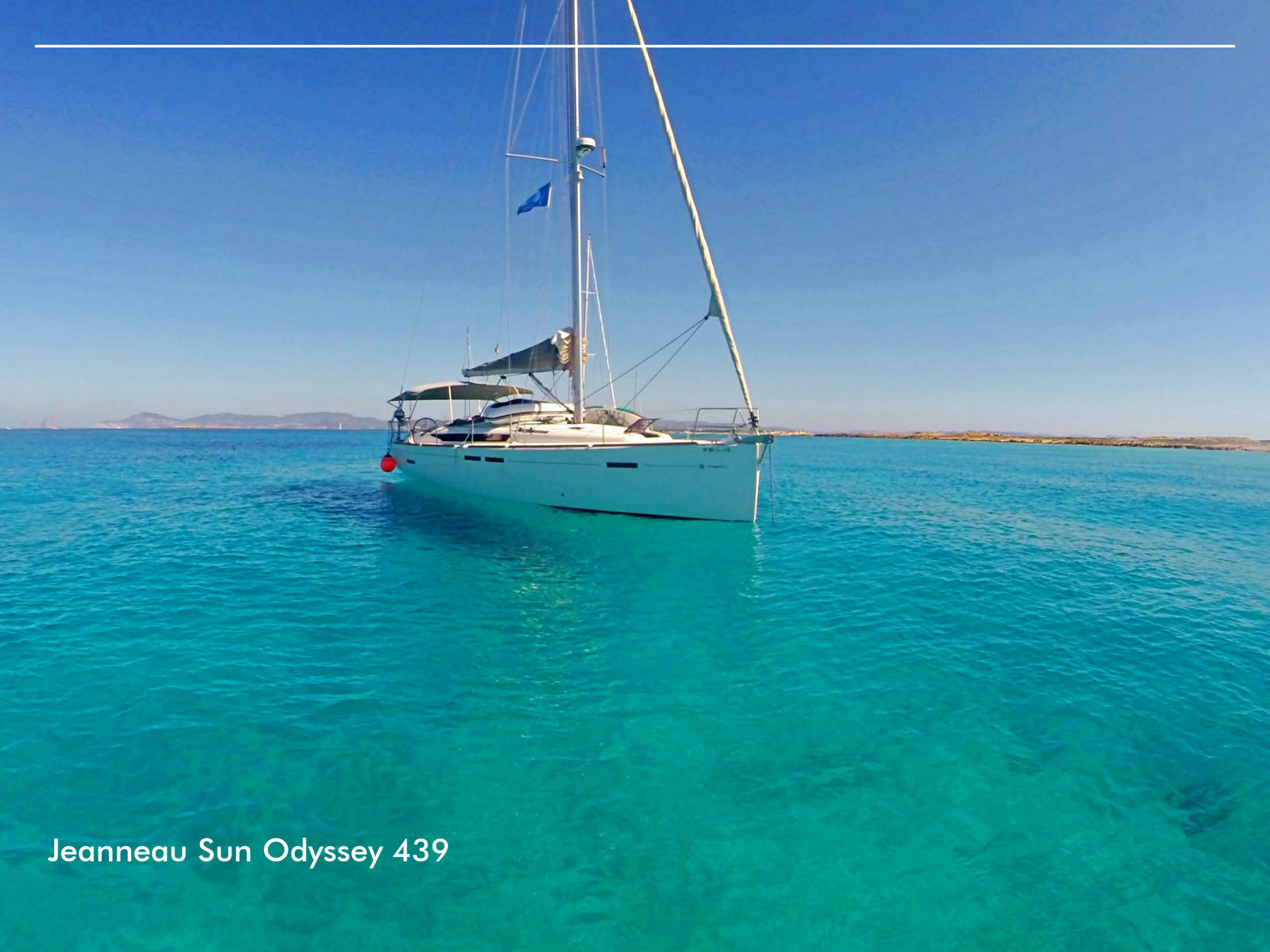
Jeanneau Sun Odyssey 439